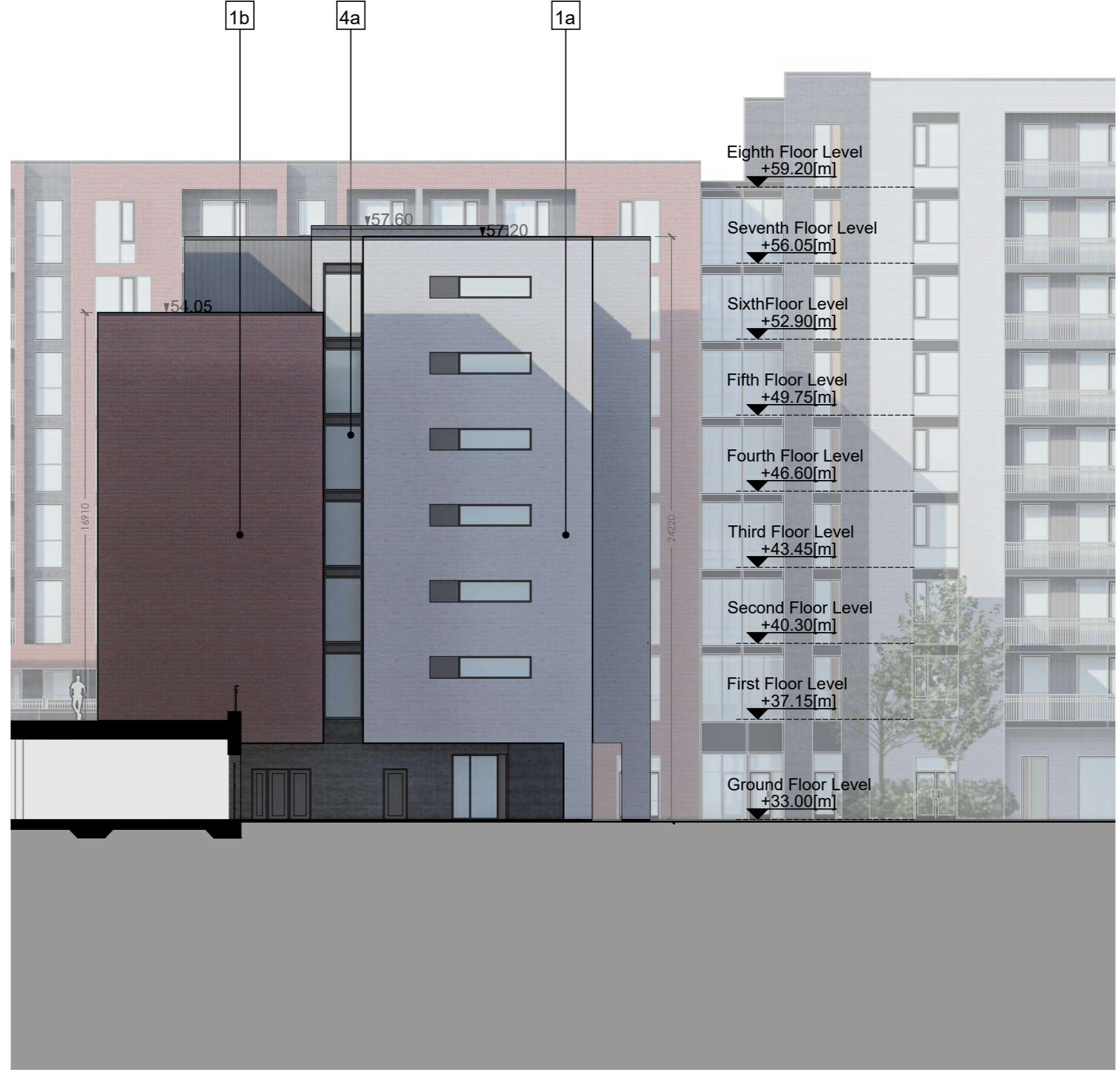
06 - Side Elevation - Block 3 Scale 1:200 @A0