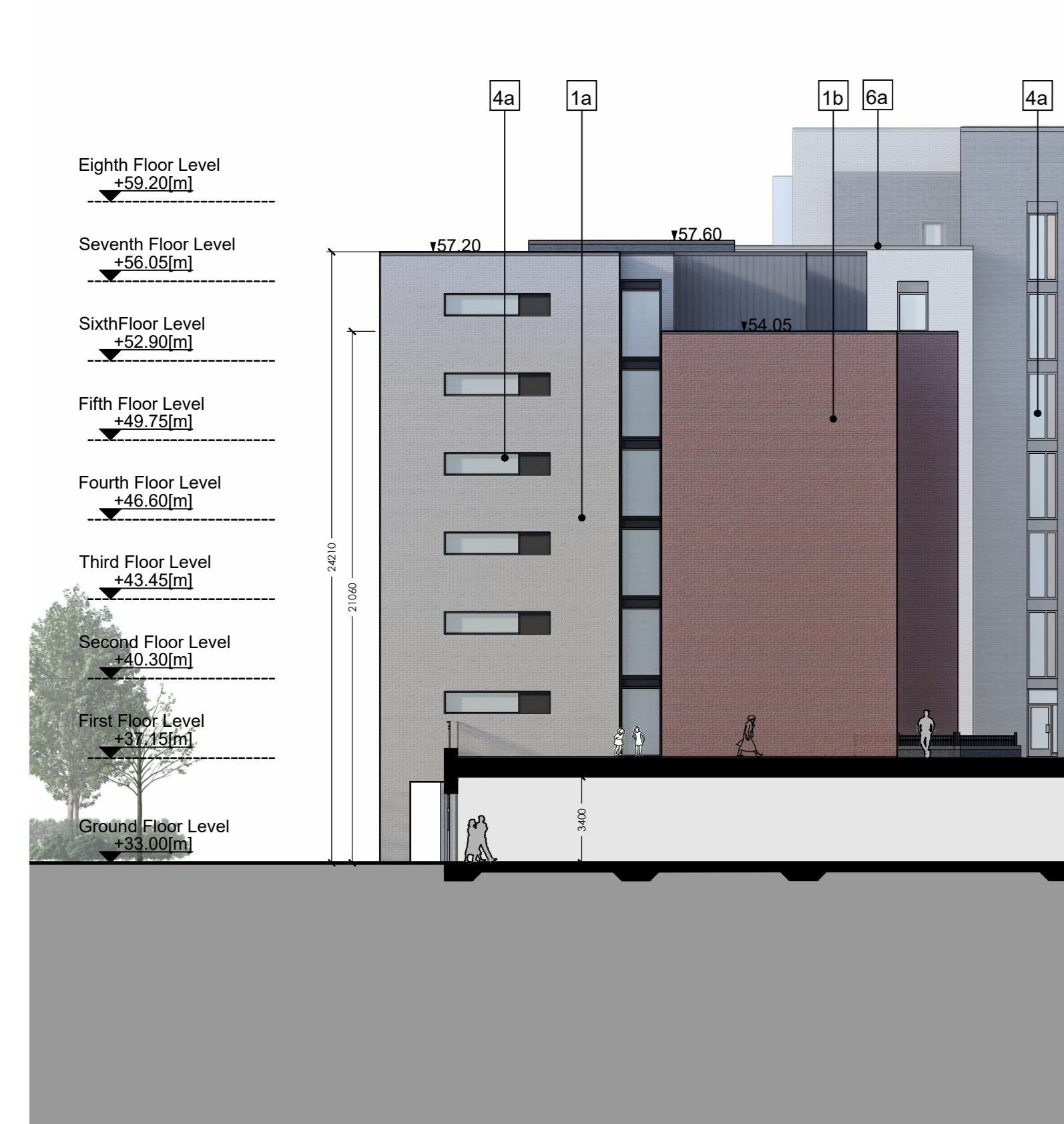
03 - Side Elevation - Block 3 Scale 1:200 @A0