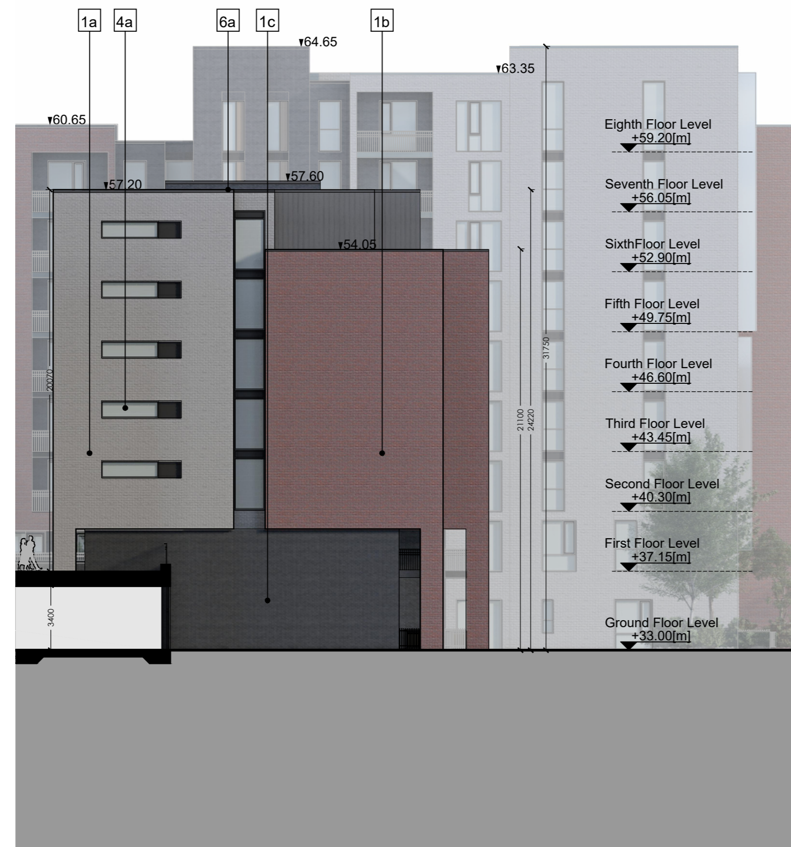
04 - Side Elevation - Block 3 Scale 1:200 @A0