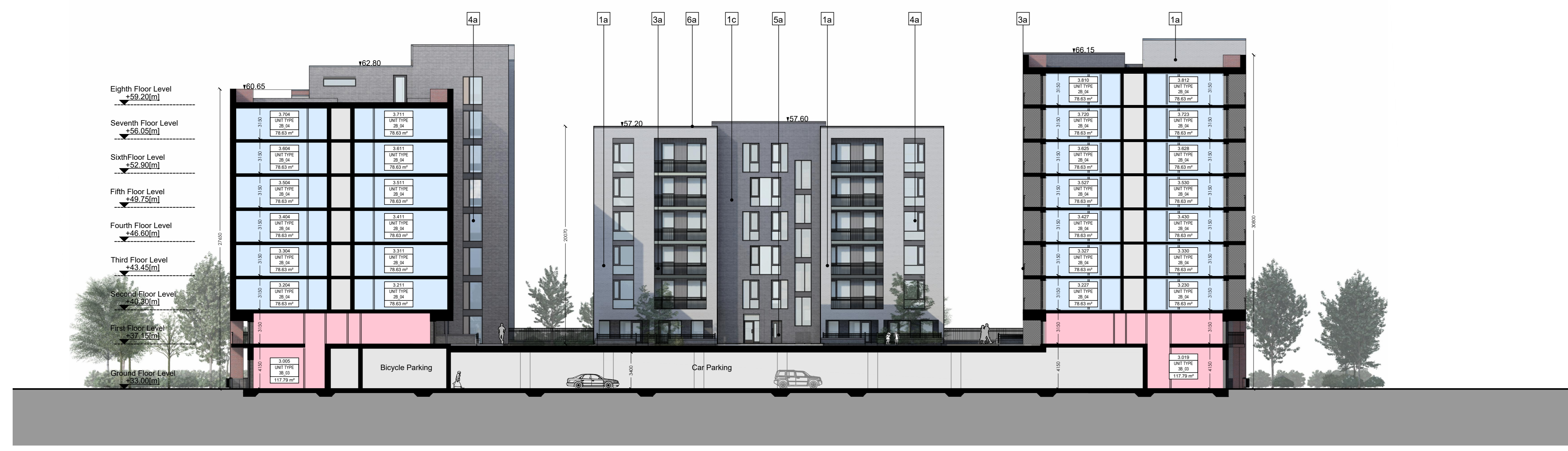
01 - North Courtyard Elevation - Block 3 Scale 1:200 @A0