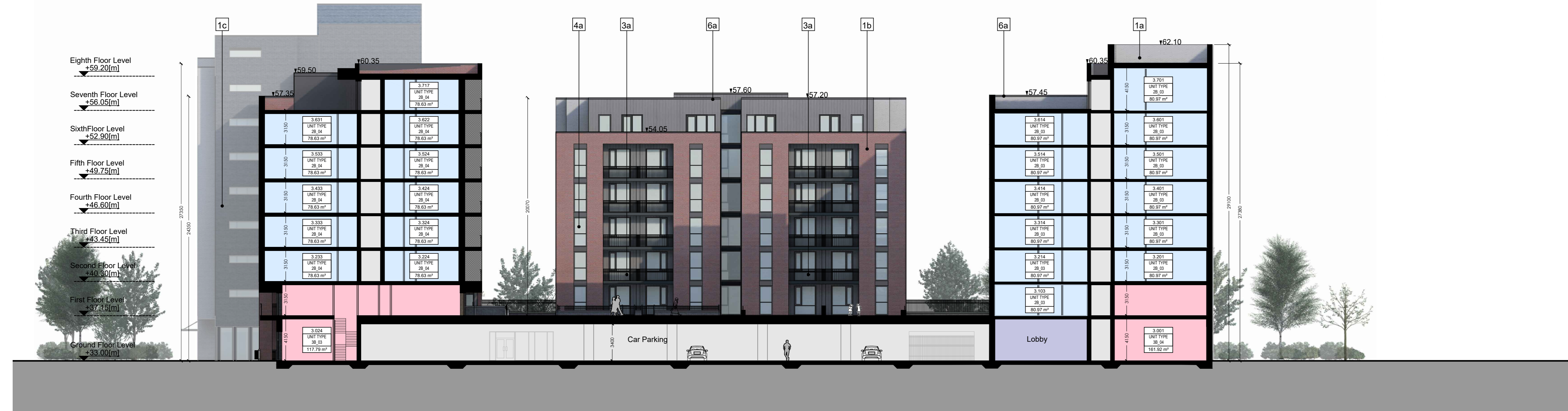
02 - South Courtyard Elevation - Block 3 Scale 1:200 @A0

Note: 1.8mm high glass balustrade can be provided on the upper level balconies if required by the Planning Authority.